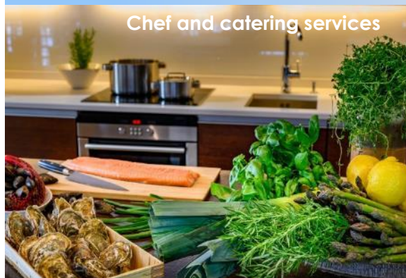
Chef and catering services