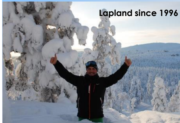
Lapland since 1996