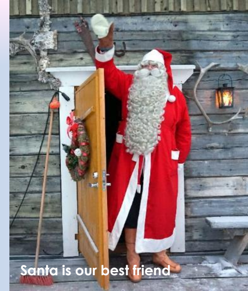
Santa is our best friend