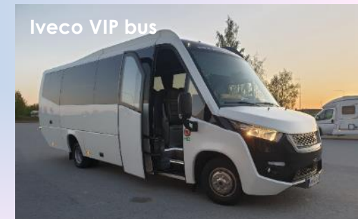
Iveco VIP bus