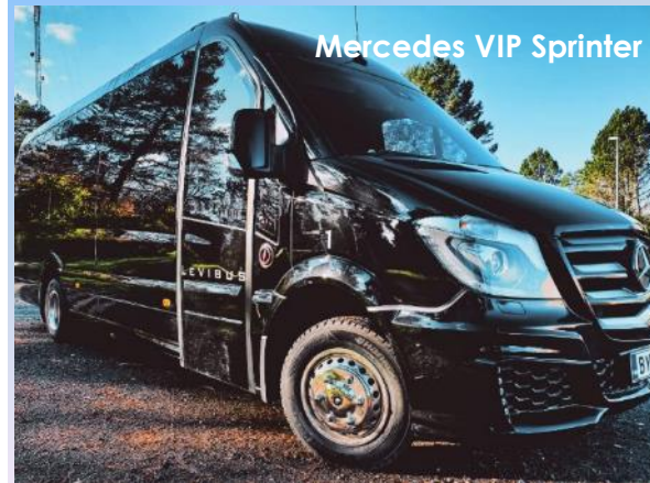
Mercedes VIP Sprinter