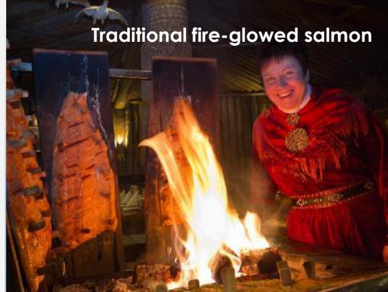
Traditional fire-glowed salmon