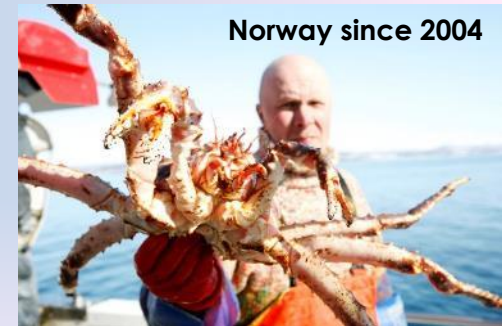
Norway since 2004