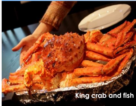
King crab and fish