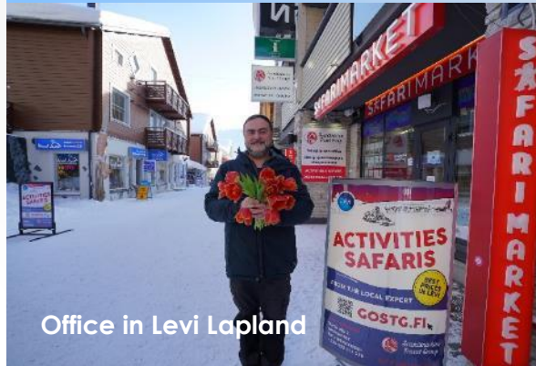
Office in Levi Lapland